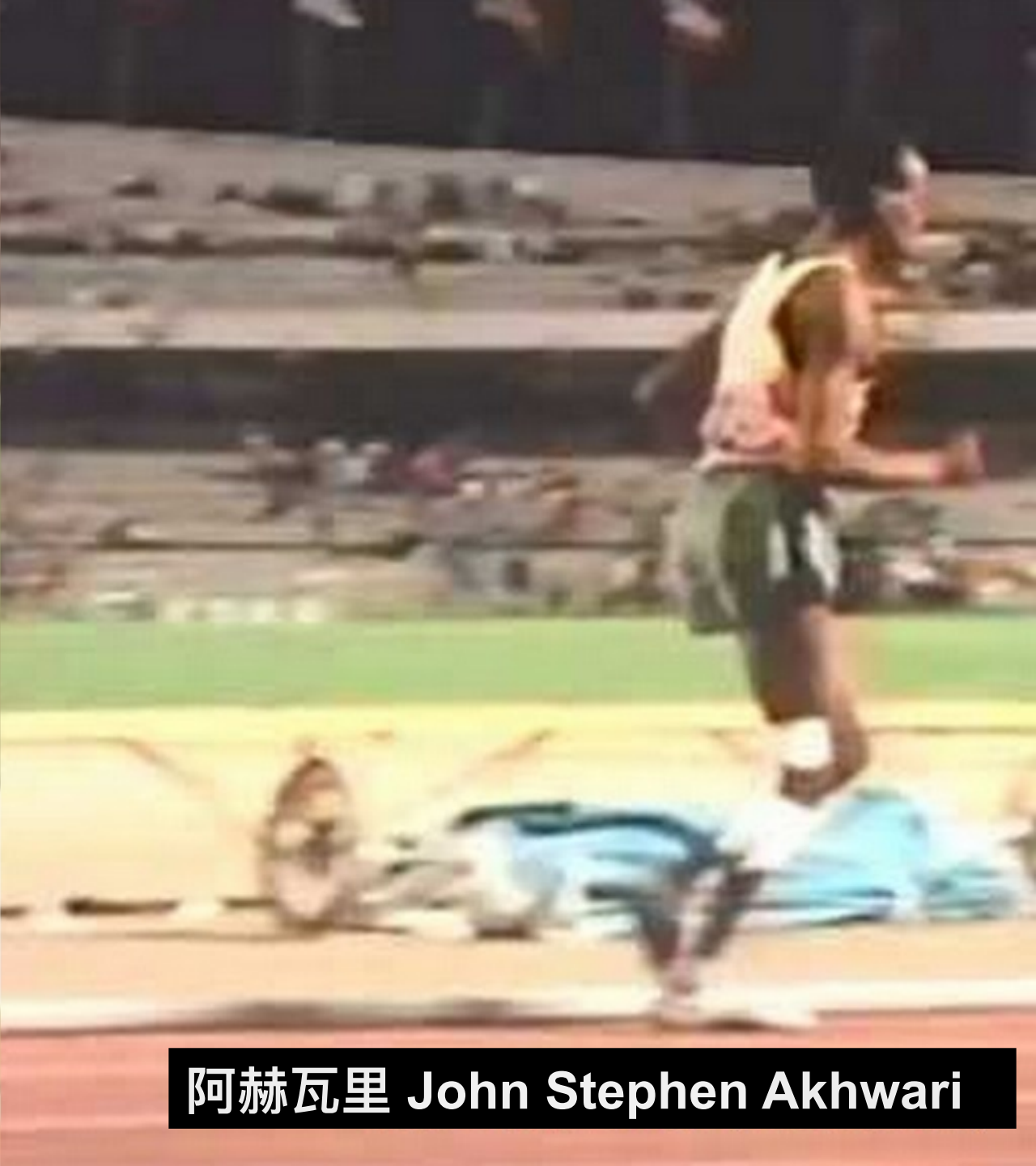
阿赫瓦里 John Stephen Akhwari