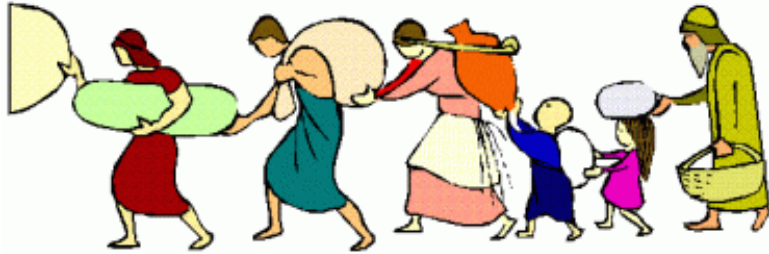
Help to carry one another's burdens.